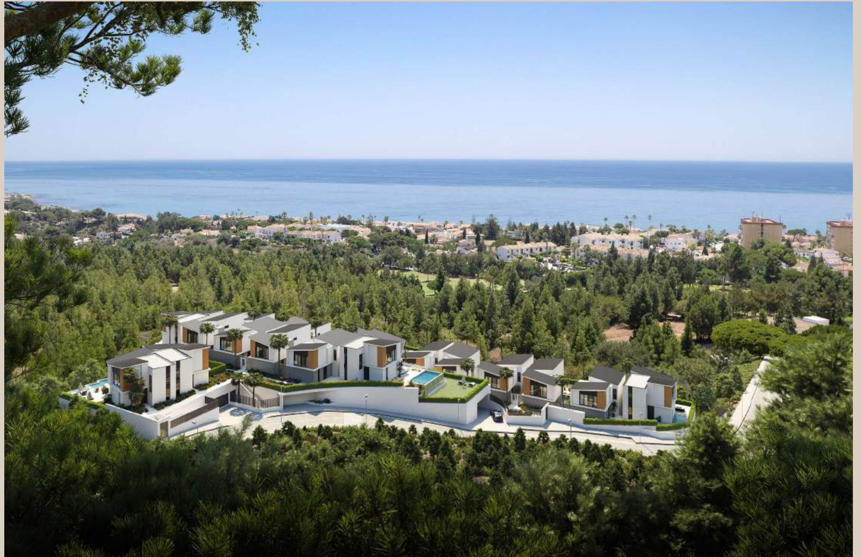
RH Privé, as the leading eco-developer on the Costa del Sol, launches with Pine Valley Villas its first project in Reserva del Chaparral.