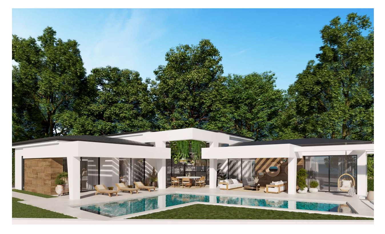
Non-binding figurative image. Optional decoration proposal.