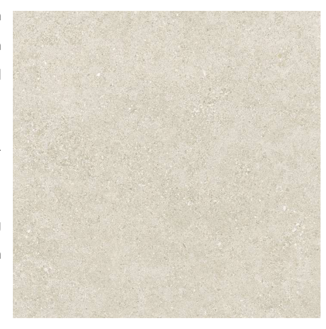
Roadstone Linen 90x90 cm

On main and secondary bedrooms Wood looking rectified porcelain Origin Umber, 22,5 x 180 cm as per below image.