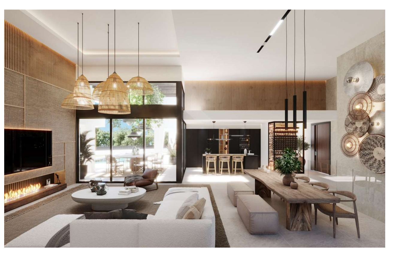
Non-binding figurative image. Optional decoration proposal.

The decoration represented in the images shown are part of the optional interior design proposal.