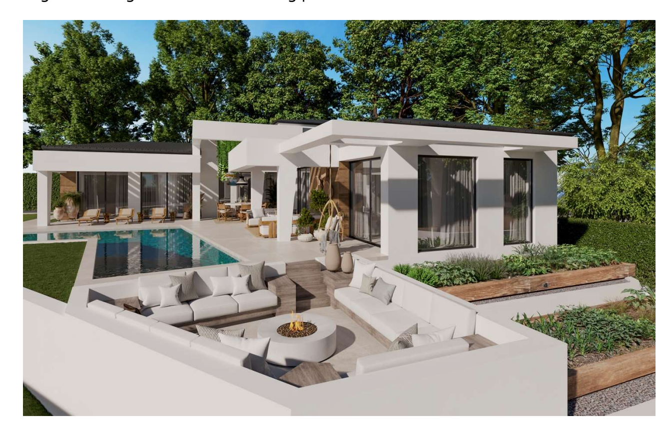
Non-binding figurative image. Optional decoration proposal.

The exterior areas of each Villa - Marein Natura have been carefully studied with the combination of its special architectural design in mind, as each house is projected on a single floor, with its own landscaping and organic garden so that you can enjoy the freshness of nature, you can cook with your own ingredients and food, perceiving the aromatic species that will characterize your home, while enjoying maximum use by having large terraces, garden areas, swimming pool and chill out area with winter fire.