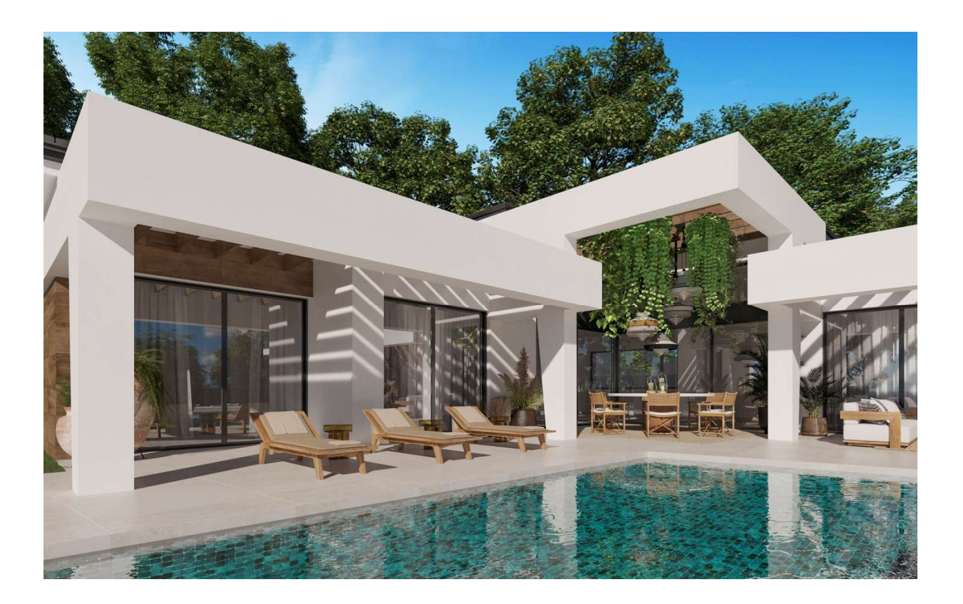
Non-binding figurative image. Optional decoration proposal.

Exterior : Technal, high-quality extruded aluminum with thermal breaks joinery. With the most advanced technologies in the sector and having numerous tests and certificates guaranteeing it. Offering the highest standards on safety and reliability. It will be provided with air intake openings for ventilation.