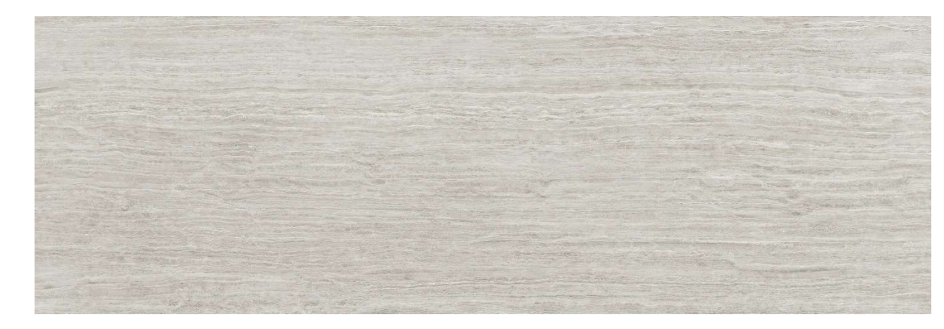
Travertino Grey 100x300 cm

In the main bathroom, a box is designed for the shower and bathtub area, fully tiled and with a great visual effect, with large-format rectified porcelain tiles with a travertine-effect finish.