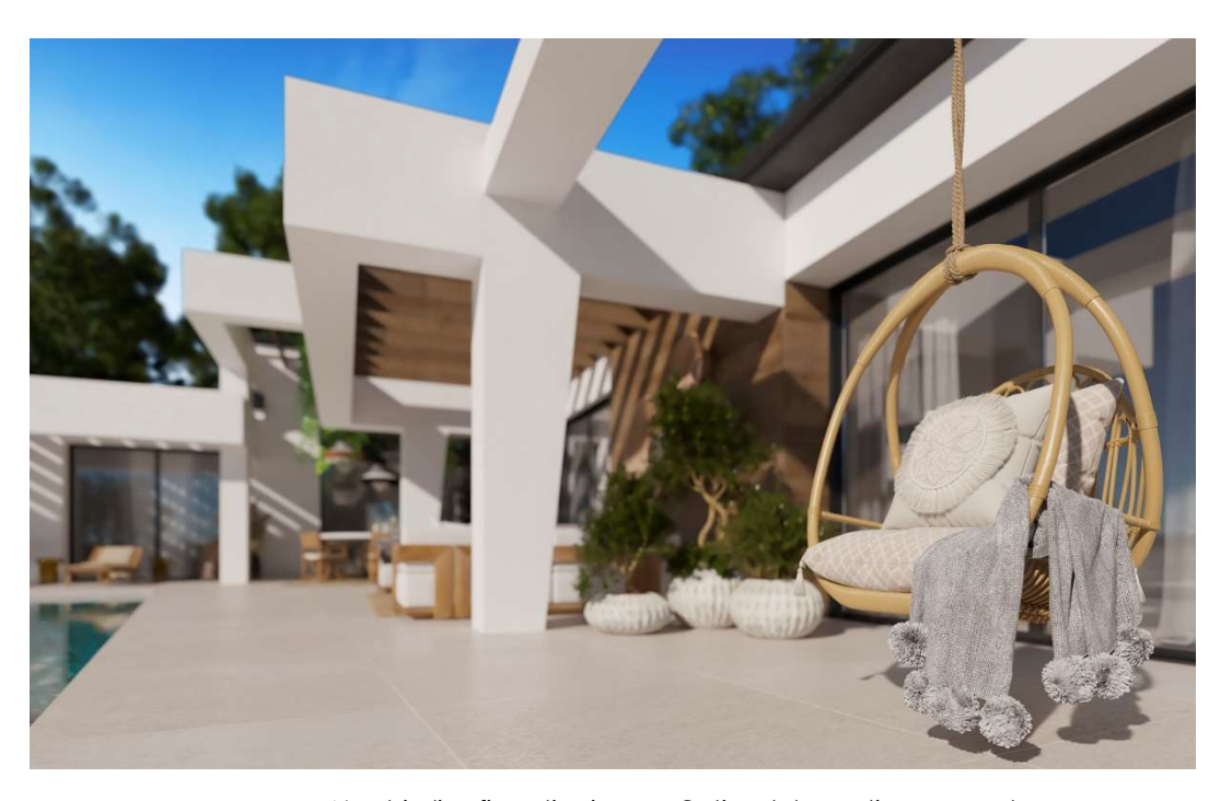
Non-binding figurative image. Optional decoration proposal.