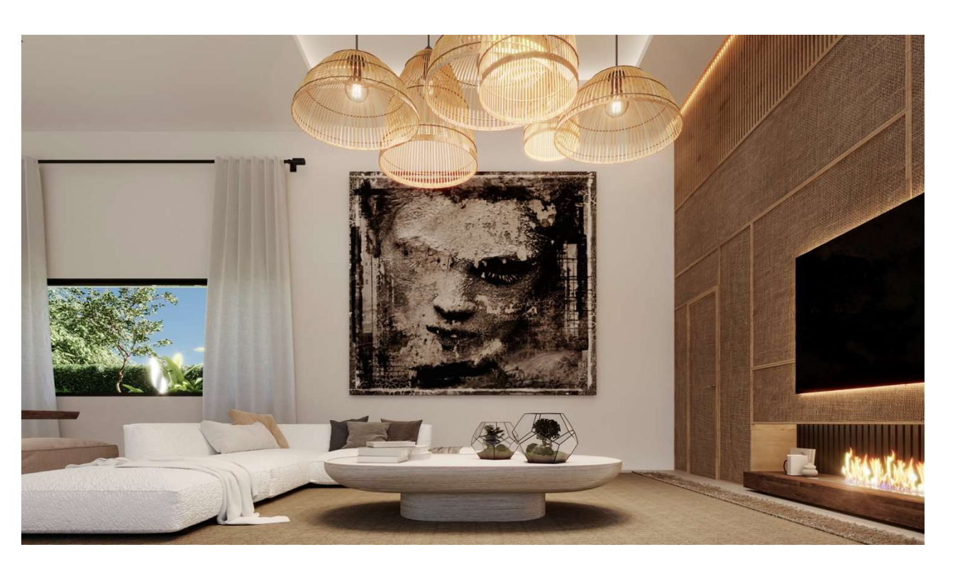
Non-binding figurative image. Optional decoration proposal.