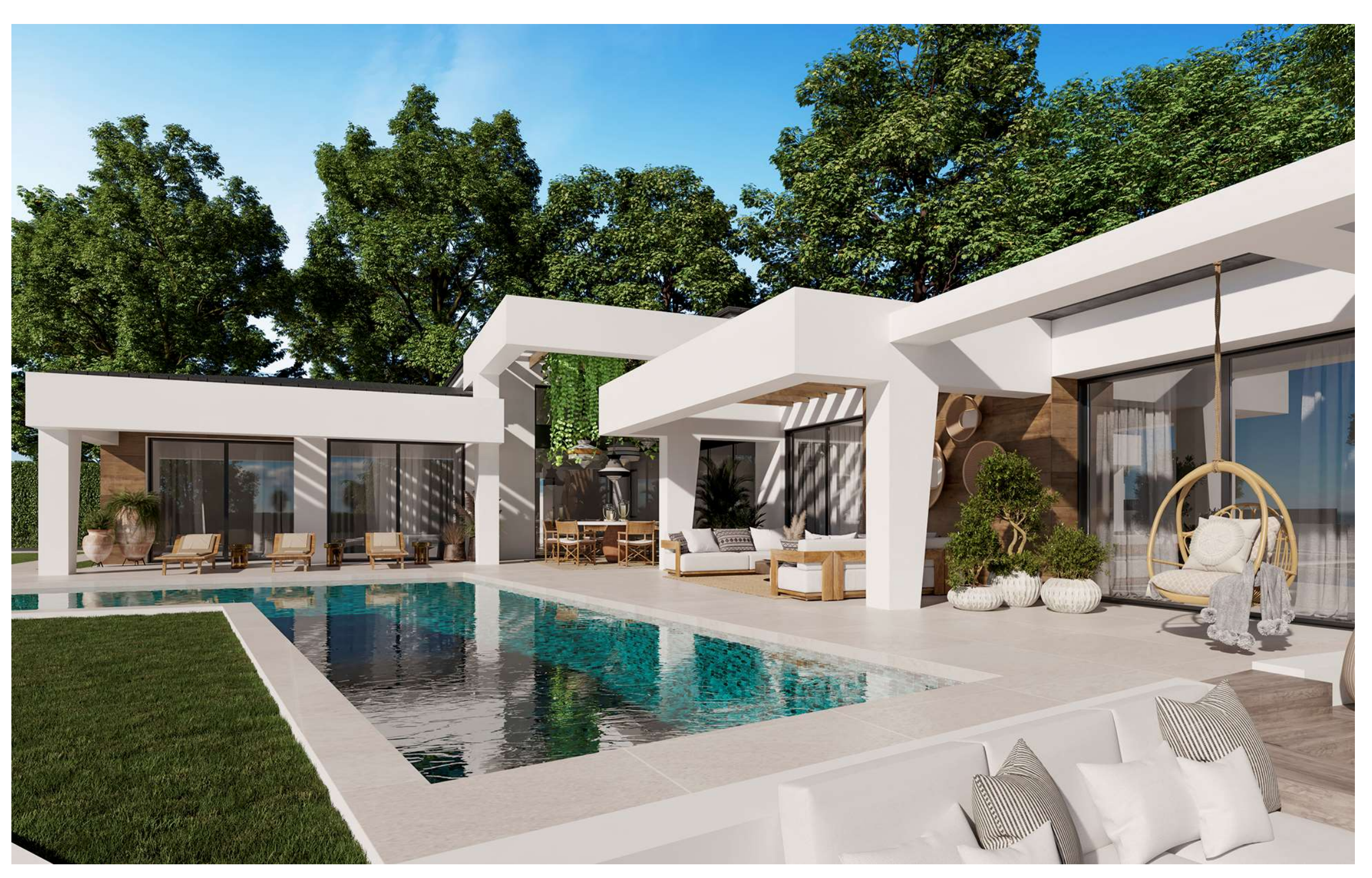
Non-binding figurative image