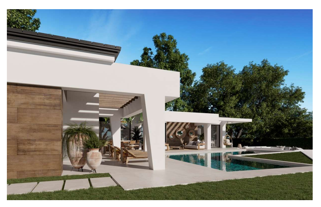
Non-binding figurative image. Optional decoration proposal.

Plasterboard system partition with Rock Wool soundproofing inside, water-repellent plasterboard panels are used in wet rooms. Made according to the guidelines of the CTE-DB-HE regulations. Energy saving; UNE 102040 IN, assembly of plasterboard partitions with metal structure.