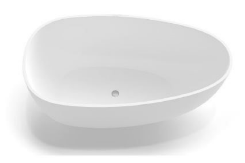
Non-binding figurative image

170 x 88 cm freestanding bathtub with floor-mounted tap.