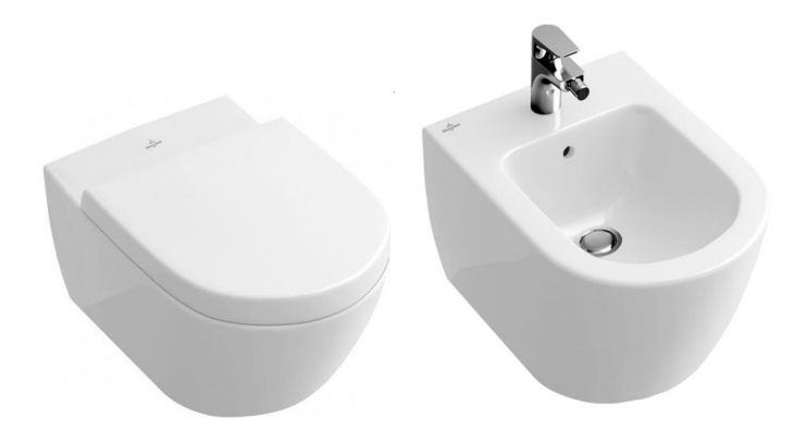
Non-binding figurative faucet.

Wall-hung toilet with cistern built into the partition with a half and full flush button, cushioned seat and lid. Villeroy Boch model SUBWAY 2.0, in all bathrooms and toilet. Bidet of the same model in the master bathroom.