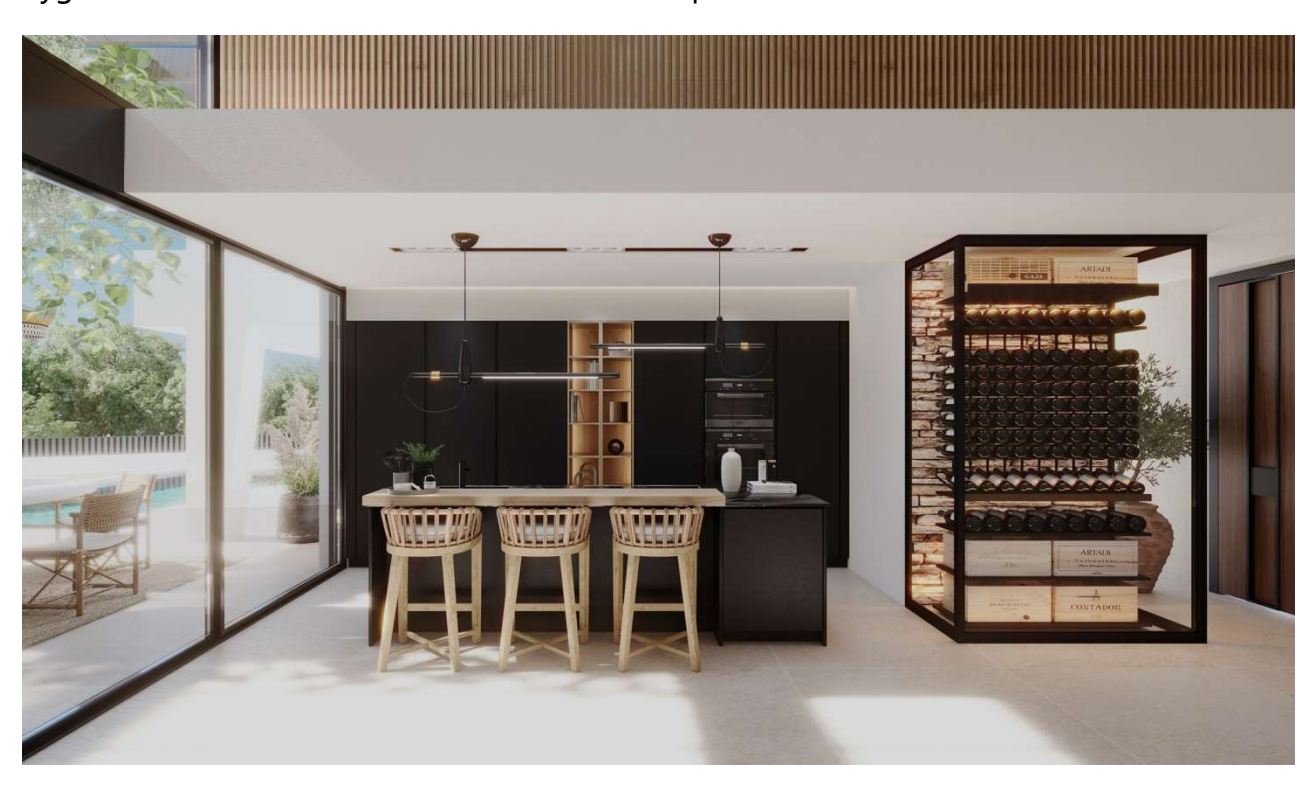
Non-binding figurative image. Optional decoration proposal.

The night gray matt lacquered fronts, extremely resistant and very easy to clean and hygienic, have been combined with a countertop shelf and bar in Olmo Natur.