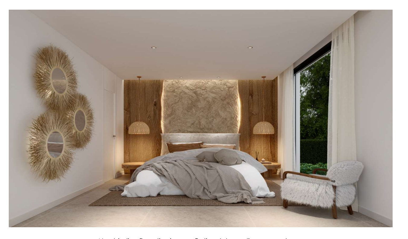
Non-binding figurative image. Optional decoration proposal.