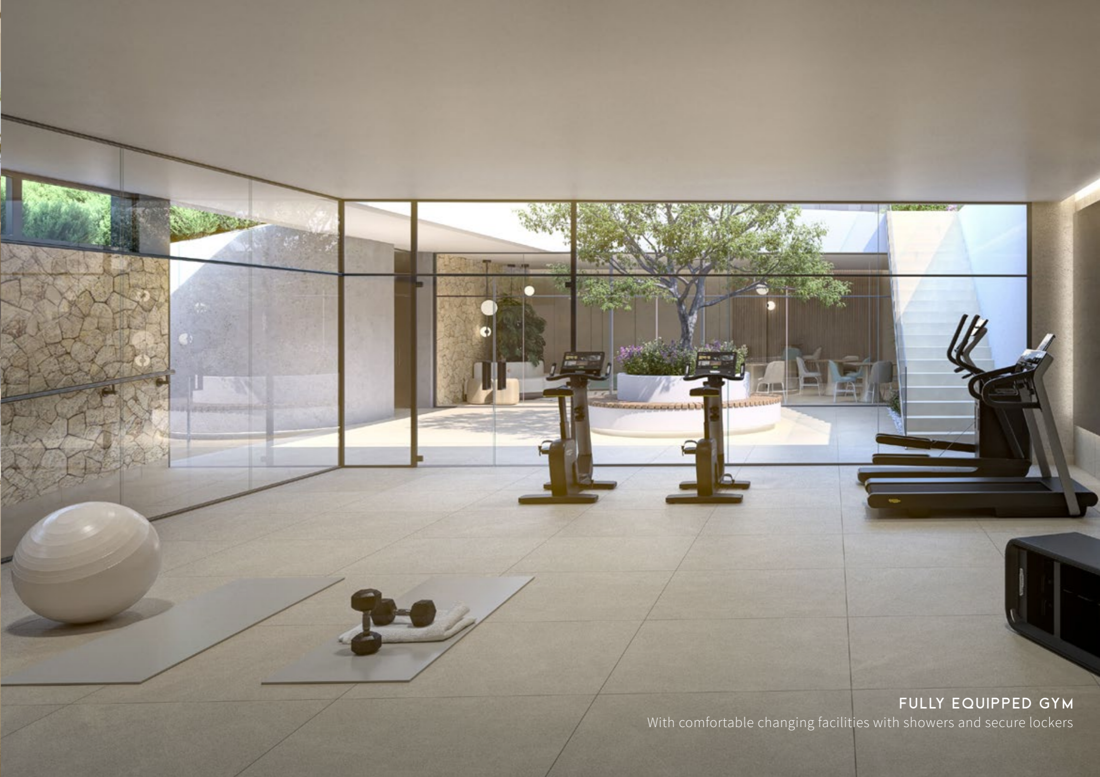
FULLY EQUIPPED GYM With comfortable changing facilities with showers and secure lockers