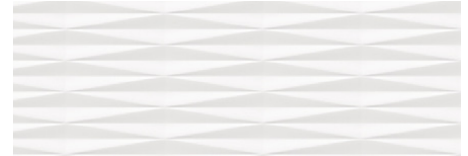
FORMIGAL 31.5 x 100 cm