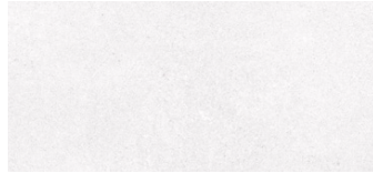
DOMUS BLANCO 31.5 x 100 cm