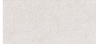
DOMUS ARENA 31.5 x 100 cm