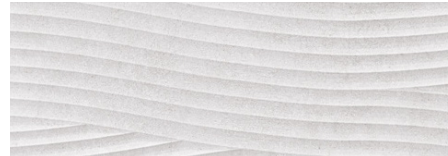
ATRIO GRIS 31.5 x 100 cm