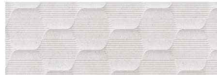
VÍA GRIS 31.5 x 100 cm