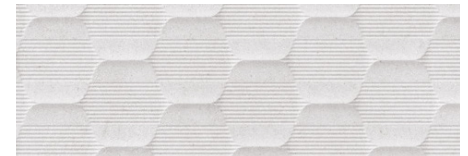
VÍA ARENA 31.5 x 100 cm