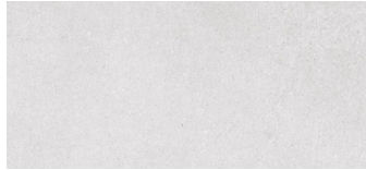
DOMUS GRIS 31.5 x 100 cm