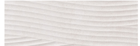
ATRIO ARENA 31.5 x 100 cm