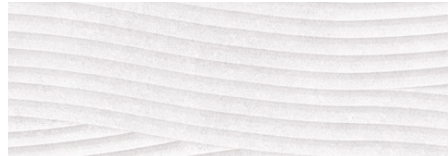
ATRIO BLANCO 31.5 x 100 cm