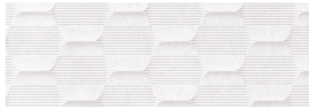
VÍA BLANCO 31.5 x 100 cm