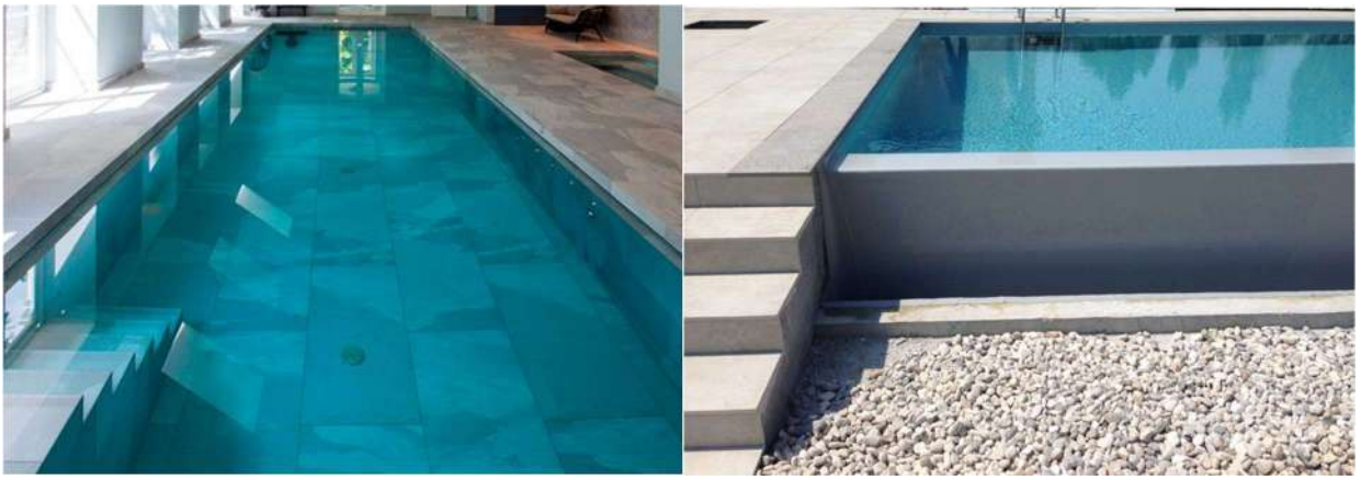
The photos do not correspond to the pools of the building. It is an example. They will be of similar design.

The building will have an indoor pool of 9.80m X 3.20m, heated that can be used all year round and another pool on the roof of the building of 12.00m X 3.90m. The deck pool is on a terrace that has sun all day and lots of privacy. The pool terrace is finished with non-slip porcelain flooring.